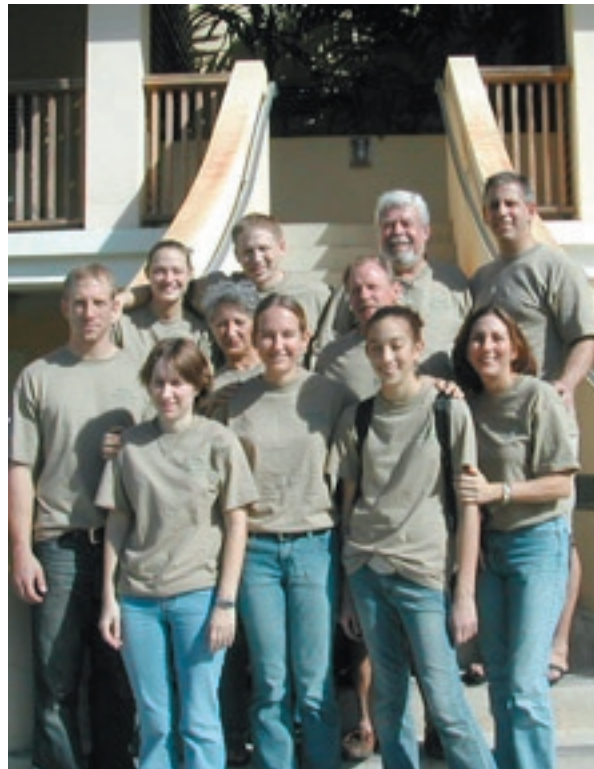
St Paul group from Boca Raton, Florida

PRAY that the Holy Spirit will move even more to search and study the Word of Life.